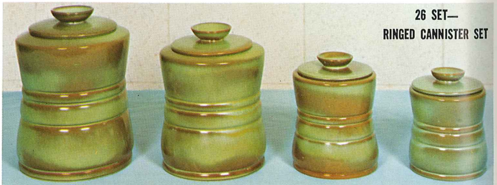
26 SET— RINGED CANNISTER SET