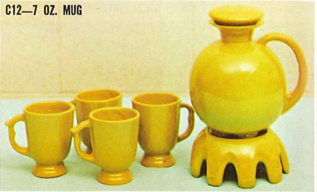
C12—7 OZ. MUG