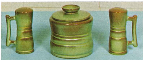
26G—SUGAR/GREASE 26H—SALT & PEPPER 4-PIECE SET/BOXED