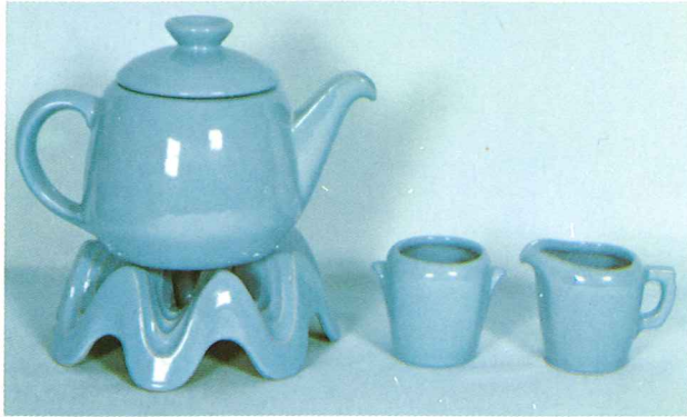
6T—6 CUP TEAPOT WA3—6" WARMER W/CANDLE