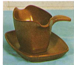
6S—TWO-SPOUT GRAVY 5PS—9" PLATTER-TRAY