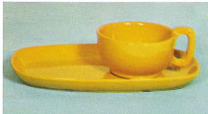
SOUP AND SANDWICH SET 4SC—11 OZ. SOUP CUP 6P—11" PLATTER-TRAY